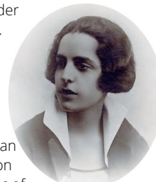
Maria Polydouri, poet (1902-1930)

In the second year, along with the continued study of language, you will work on a range of literary and cultural movements (Romanticism, Demoticism, Modernism, Surrealism etc.) and focus on specific areas of interest in consultation with your tutor (including Medieval and Early Modern Greek language and literature, historical linguistics, translation theory, the work of individual authors, Greek cinema, and gender and/in literature). These interests can be further pursued in your final year, which also offers the option of writing an Extended Essay on an approved topic of your choice.