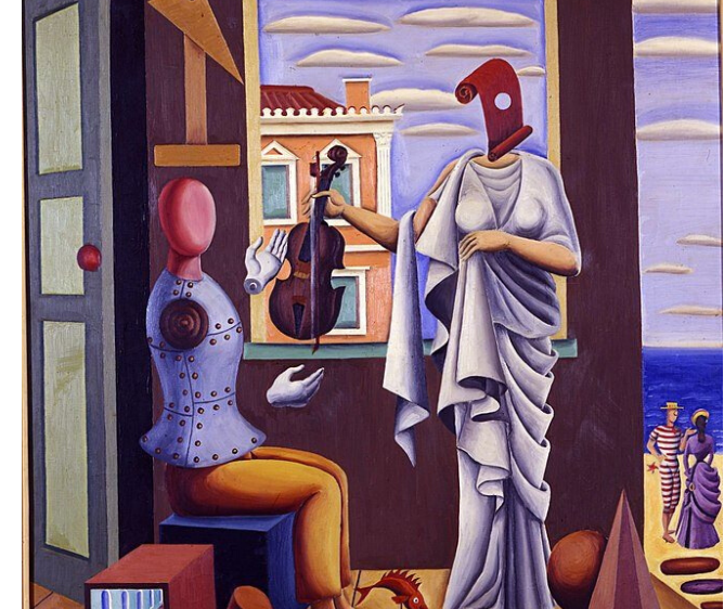
Nikos Engonopoulos (1907-1985), The Poet and the Muse (detail)