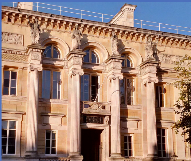
The Taylor Institution Library